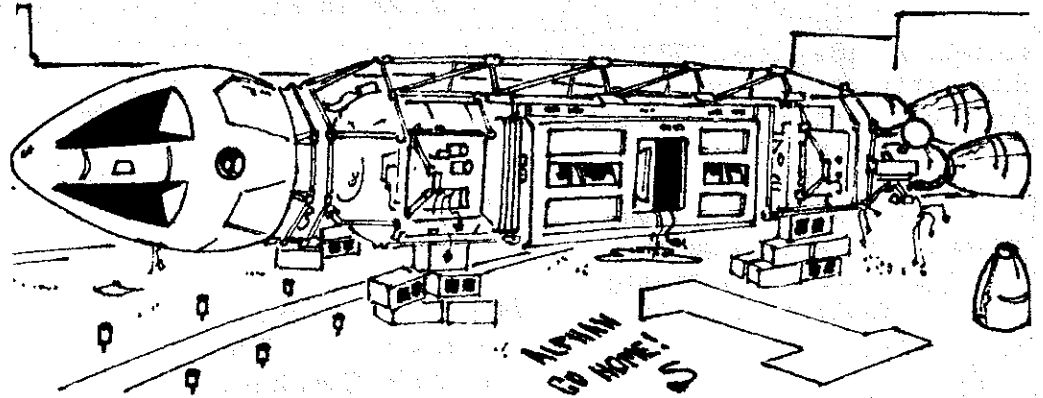
Crime Strikes! Shown beside the vandalized Eagle are: (Left to right)